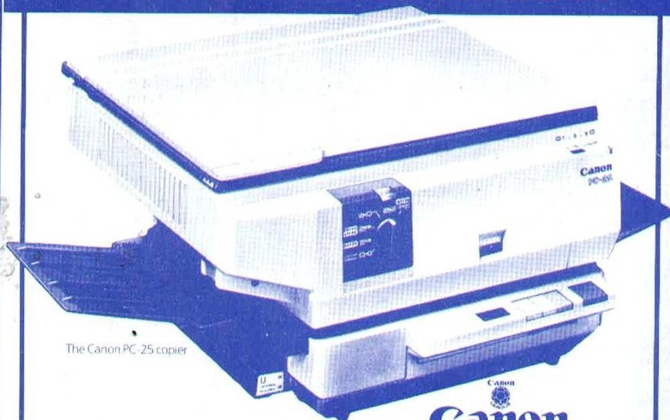
The Canon PC-25 copier

So reliable you'll never need a substitute.